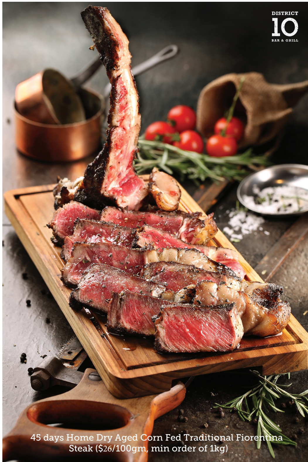
45 days Home Dry Aged Corn Fed Traditional Fiorentina Steak ($26/100gm, min order of 1kg)

"This is the place I now recommend for a good-value and good-tasting steak"